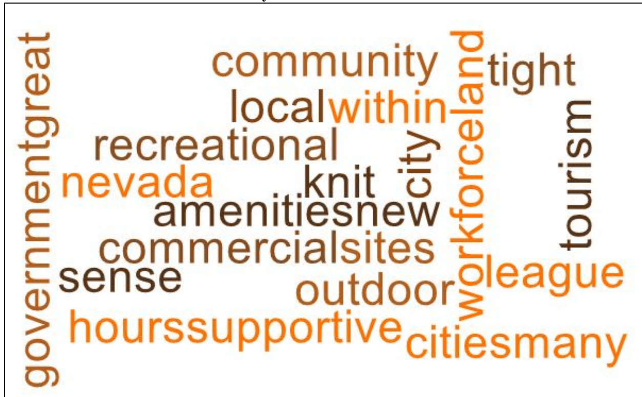
Figure 2.1 – Economic Development Strengths City of West Wendover

The community’s existing identity and culture as well as the responsiveness and accessibility of the City of West Wendover’s municipal government remain among the top of the various economic development strengths for the City of West Wendover identified by survey respondents. Respondents noted that the community of West Wendover is unique within the northeastern Nevada region given its geographic location along the border of Nevada and Utah, and its close economic connection to the western front of the Wasatch Range. The geographic separation between the community of West Wendover and other parts of the northeastern Nevada region has led to a very ‘tight knit’ and interconnected community where individuals typically support each other, work together to address issues of community concern, and each contribute to maintaining and enhancing the community’s relatively high quality of life. While respondents recognized the need to sustainably grow the community’s existing residential population and civilian workforce, workshop participants noted that it is just as important to maintain and preserve these existing community qualities and characteristics.