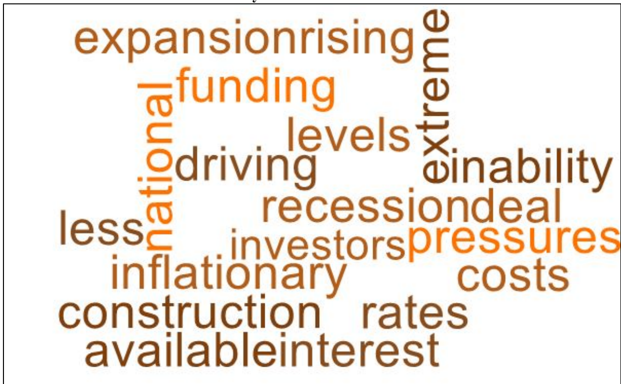
Figure 2.4 – Economic Development Threats City of West Wendover

Among the various economic development threats identified by survey respondents, the two most immediate threats to existing community and economic development efforts are the unstable national economy and limited financing available for business expansion. High inflation and fears of an impending recession have increased costs more quickly than wages, particularly with regards to construction costs. If the cost of construction does not begin to deflate, it could severely inhibit the City of West Wendover’s progress toward their strategic goals. Inflation has also made it more difficult for businesses to secure financing for expansion.