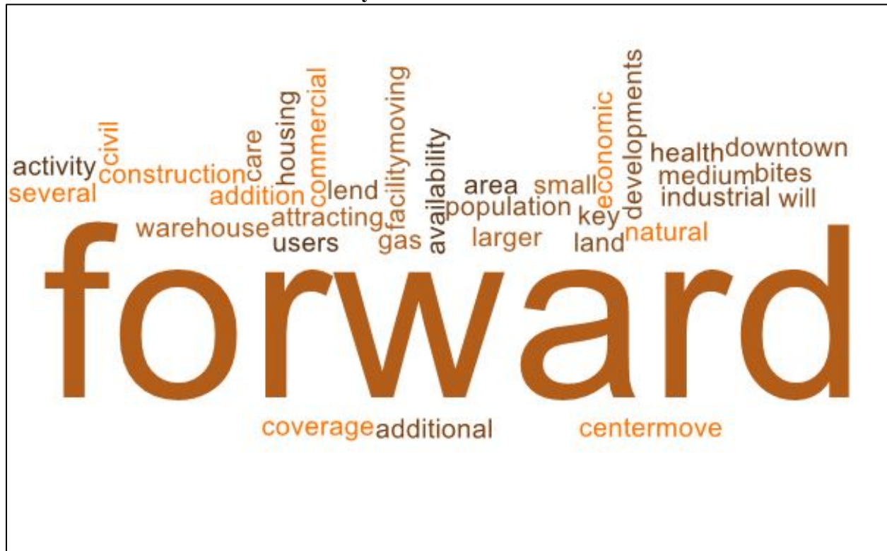
Figure 2.3 – Economic Development Opportunities City of West Wendover

Survey respondents agreed that a major community and economic development opportunity for the City of West Wendover is the continued development of the community’s established downtown through further implementation and completion of the existing Mainstreet plan. There is a significant surplus of demand for expanded commercial retail and entertainment services among the community’s existing residential population and the relatively large number of annual visitors and tourists to the community could support new commercial retail and entertainment services developed, is part of the continued implementation of the existing Mainstreet plan. Survey respondents also noted that further development of the identified downtown core, part of the existing Mainstreet plan, could also create a vibrant and central community civic center that could lead to increased sustainable population growth over time. Capitalizing on the community’s authentic ‘western’ heritage and cultural identity through targeted infill development could also significantly improve the community’s overall attractiveness to additional visitors and tourists.