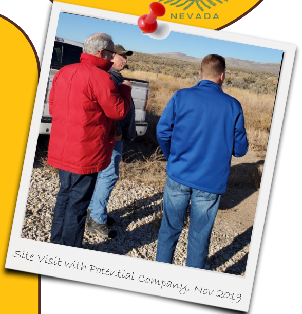
Site Visit with Potential Company, Nov 2019

current challenges facing Northeastern Nevada businesses as well as developing projects that will demand a more robust infrastructure in the future. Such collaboration will ensure that Northeastern Nevada has the capacity to support and foster economic growth within the region.