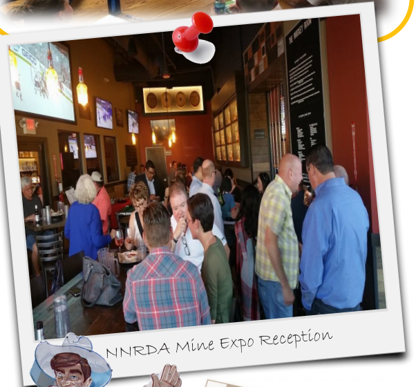
NNRDA Mine Expo Reception