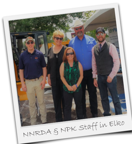
NNRDA & NPK Staff in Elko